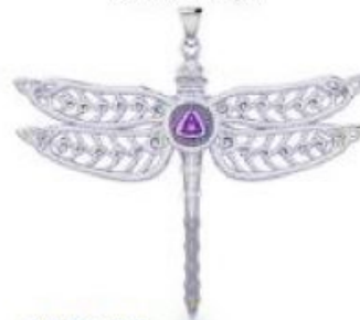
Pendant PT5389A Genuine Sterling Silver Genuine Amethyst