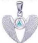
Pendant PT5846T Genuine Sterling Silver Genuine Blue Topaz