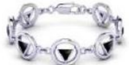
Bracelet B689 Genuine Sterling Silver Synthetic Black Onyx