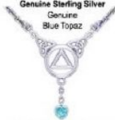
Necklace N557T Genuine Sterling Silver Genuine Blue Topaz