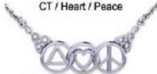
Necklace N556 Genuine Sterling Silver CT / Heart / Peace