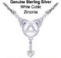
Necklace N557Z Genuine Sterling Silver White Cubic Zirconia