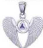
Pendant PT5846A Genuine Sterling Silver Genuine Amethyst