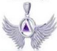
Pendant PT5846 Genuine Sterling Silver Genuine Amethyst