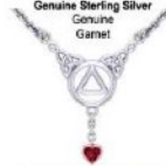
Necklace N557G Genuine Sterling Silver Genuine Garnet