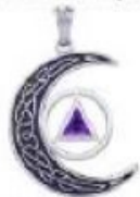
Pendant PT5843 Genuine Sterling Silver Genuine Amethyst