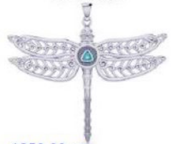
Pendant PT5389T Genuine Sterling Silver Genuine Blue Topaz