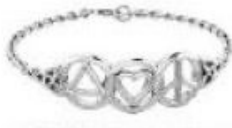
Bracelet B406 Genuine Sterling Silver CT / Heart / Peace